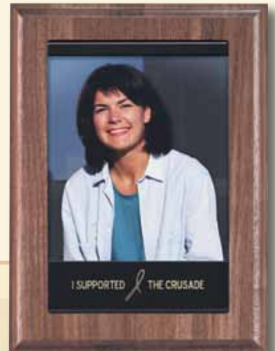
QPP205A-BK 6" x 8"

The Recognition Pocket™ Perpetual Photo Plaques combine easy release individual plates with hand-rubbed American Walnut veneer. No more unscrewing and replacing plates every month. Our exclusive Magnetic Release™ feature for all plates allows you to use your finger to push out the plate or photo holder with one simple move and replace it with a new one. The photo holder can then be easily placed in either of the individual plaques, and be issued to the winner of the award.