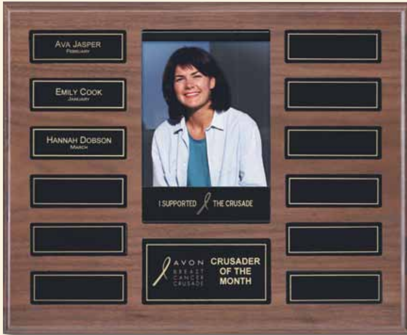
12 Plate perpetual plaque QPP205D-BK 10-1/2" x 13"