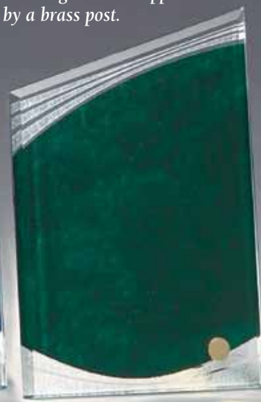
QG100A-* 4" x 6"

Example of sandcarving with gold color-fill