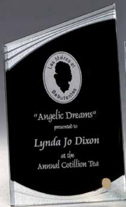
QG100B-* 4 1/2" x 7"

Available in 3 sizes. The A and B sizes are 1/4" glass and supported by a brass post.