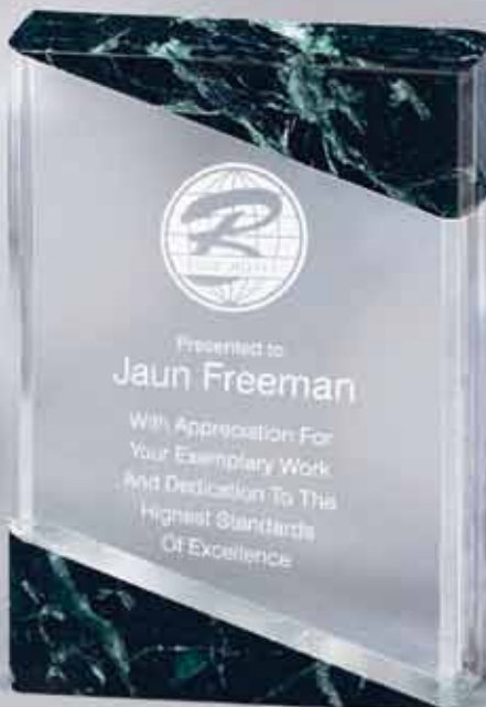
QG102B-GN 4" x 6" x 1/8" Example of first surface laser engraving