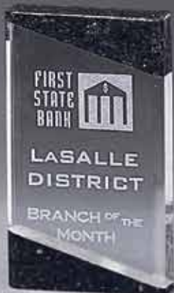
QG102A-BK 3" x 5" x 3/4"