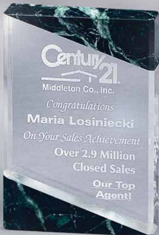
QG102C-GN 5" x 7" x 1/8" Example of first surface laser engraving