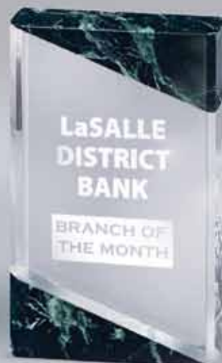
QG102A-GN 3" x 5" x 3/4" Example of reverse laser engraving

Beautiful solid granite and marble combine with glass to create elegant vertical or horizontal stand up awards. Available in 2 distinctive colors: black (BK) or green (GN). Available in 3 sizes.