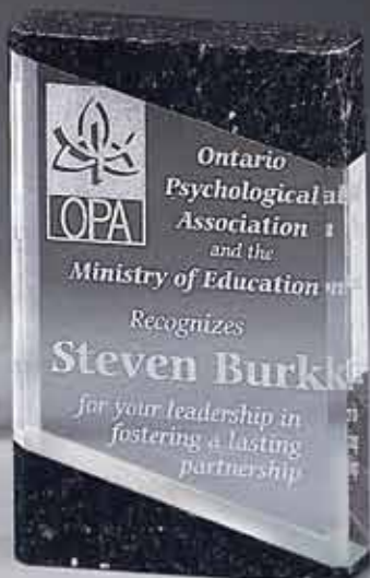
QG102B-BK 4" x 6" x 1/8" Example of reverse laser engraving